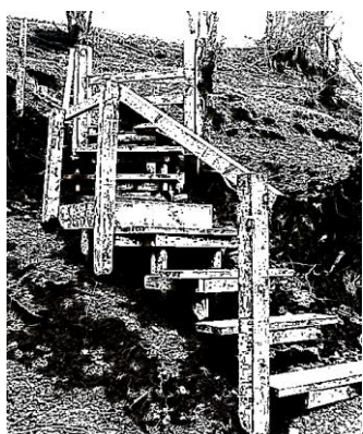
Some of Flintshire's Stilework

3. Turn left along Ffordd yr Odyn and follow it to a drive to a large house called Tyn y Coed. There is a footpath sign pointing down the drive. Walk down the drive to the garden of the house where you turn left over a stile into a field. Turn right and go down the field past the house. At an intersection of open field entrances go straight on keeping the hedge to your right past one gate until another gate is reached which gives access to the next field on the right. Go through that gate and angle across the field towards the farm house in the distance. You will cross two stiles either side of a footbridge crossing a ditch. Head towards the gate giving access to the farm yard and turn right having gone through that gate to a gate just beyond the house with metal girder posts. Go through that gate and alongside the house in the field to another stile giving access to woodland either side of the stream; once again the Terrig. Go down the intricate series of stile and steps to a footbridge and cross the stream into the next field.