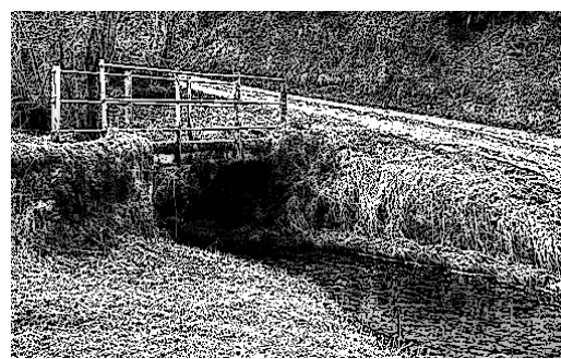
Footbridge over the Terrig

1. Walk directly up the lane opposite the school called Ffordd Rhyd y Ceirw. This levels off and eventually goes down to a lovely ford and footbridge over the stream (the Terrig). Go up the other side to where the lane joins the main road and there you will see an old public footpath sign and stile.